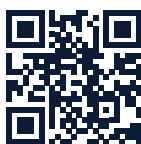
Safer Drivers Petition

Communities are safer when we all do our part and improve our personal safety. I organized a crime prevention workshop with Peel Police. Sign up for the upcoming online crime prevention education series based on the live workshop. Please also sign our Safer Drivers = Safer Roads petition.