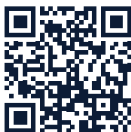
Crime Prevention Series